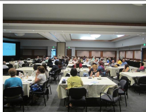
WMSHP September 17 seminar at Shady Grove Campus.

The Promotion of Positive Leadership Values entails working not merely as colleagues, but as friends. I am dedicated to keeping an open mind, and will encourage all new ideas and insights across every avenue of leadership. As professionals, it is paramount that each of us encourage and foster an environment where good ideas can grow into great ones. Demonstrating positive leadership values, and encouraging these values in others is central to the continued success of