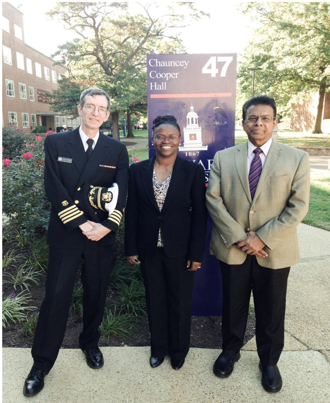
WMSHP Meeting With Howard University College of Pharmacy (HUCOP) new Dean (see article on next page)